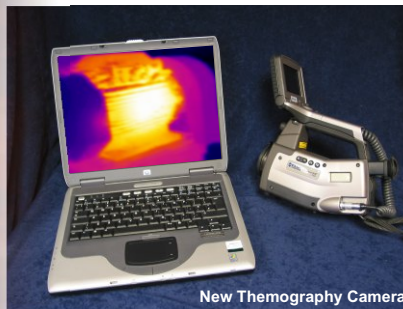
New Thermography Camera

appears to be overheating then an image of the component is recorded. On completion of the survey all data is downloaded into the reporting software where faults and recommendations are documented. A copy of the report is then supplied to the customer in either paper format or on CD-ROM"